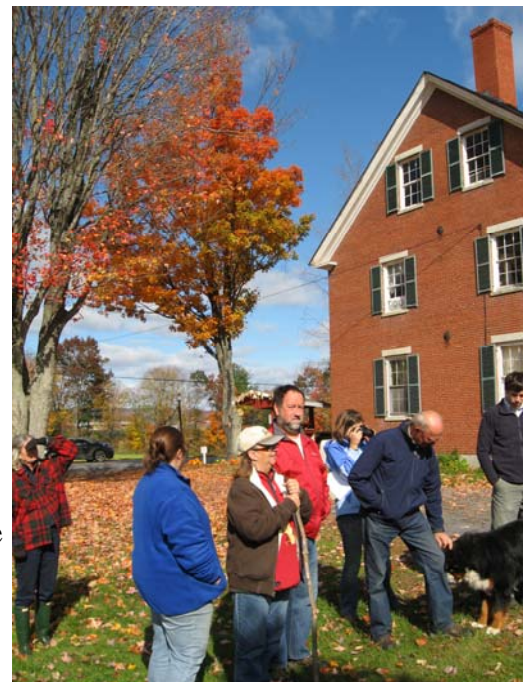
2008 FALL TOUR OF CONSERVATION PRACTICES, BUNTEN FARMHOUSE KITCHEN